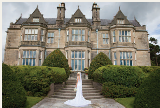
LAURA AND BENNY PHOTOGRAPHY