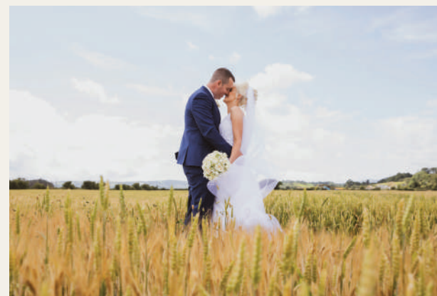
LAURA AND BENNY PHOTOGRAPHY