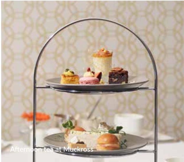
Afternoon tea at Muckross

Reception: Dial '0' for Assistance www.muckrosspark.com