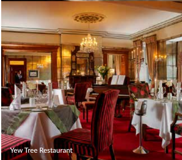
Yew Tree Restaurant