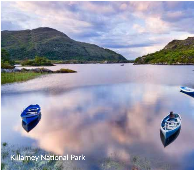
Killarney National Park

Reception: Dial '0' for Assistance www.muckrosspark.com