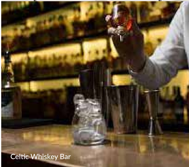
Celtic Whiskey Bar