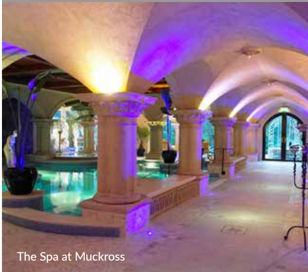
The Spa at Muckross