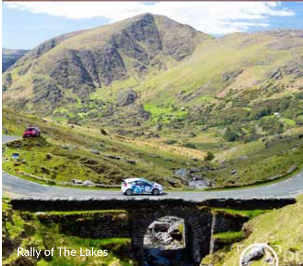
Rally of The Lakes