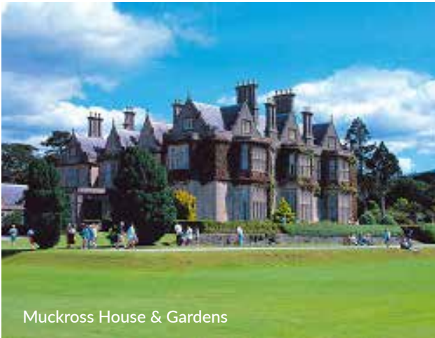
Muckross House & Gardens

Please contact our concierge department for advice or bookings on any of the activities below and many more by dialling '0'